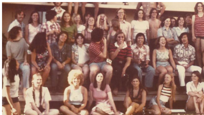
Integrated Studies 1974-1975

In 2006, ISP was renamed Integrated Studies Honors Program (ISHP). Academic Senate encouraged greater administrative structure, clarity, and coordination with College based honors programs regarding ISHP and DHC. Overtime, these two semi-autonomous programs created fissures—faculty loyalty, student antagonism, course structure—related to bifurcated structure, which failed to fully advance an unified honors experience. By 2014, a University Honors Program (UHP) proposal was submitted to address inherent flaws, while increasing faculty participation and providing students with a four-year program that was transparent. Students from limited-income, first-generation, and underrepresented backgrounds were given greater consideration based on a holistic review to further advance equity and access. Today we remain a four-year program that offers small, experiential learning opportunities, a first-year living learning community for frosh students, and one that reflects the four undergraduate Colleges and diversity of the University. This honors foundation seeks to build community and opportunity, while becoming a national model of inclusive excellence befitting a world class, research intensive, land grant institution.